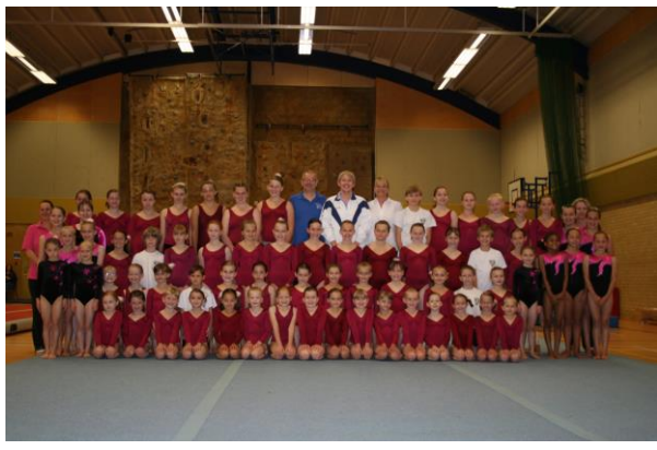
Funding was awarded to the Carterton Gym Club in 2011

The Trustees are always interested to hear of ways they could increase funds to be able to extend the number and size of grants given.